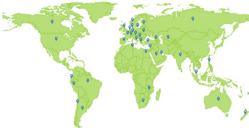
IPSO Membership World Map

Surpassed our 4-year membership target within 1 year: