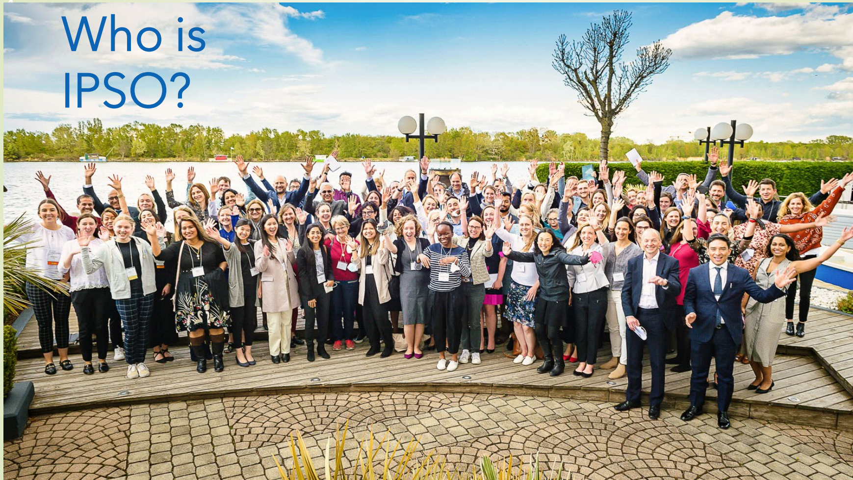
IPSO Founding Members' Congress, Vienna, April 2022