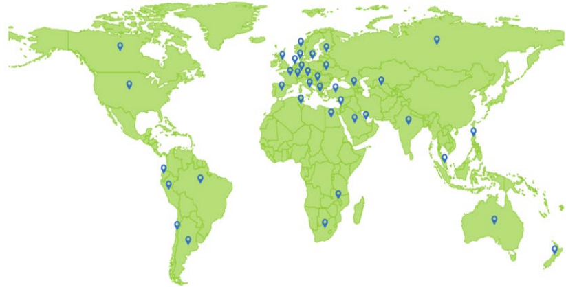
IPSO Membership World Map

Surpassed our 4-year membership target within 1 year: