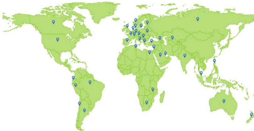
IPSO Membership World Map

Surpassed our 4-year membership target within 1 year: